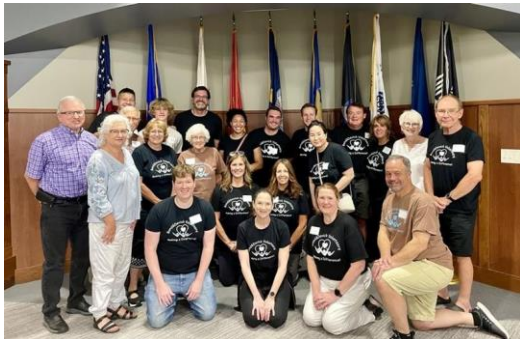
MN Vet’s Home Casino Day Volunteer