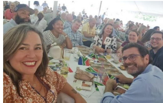
Arm in Arm in Africa