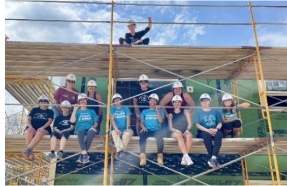
Habitat for Humanity – Women’s Build